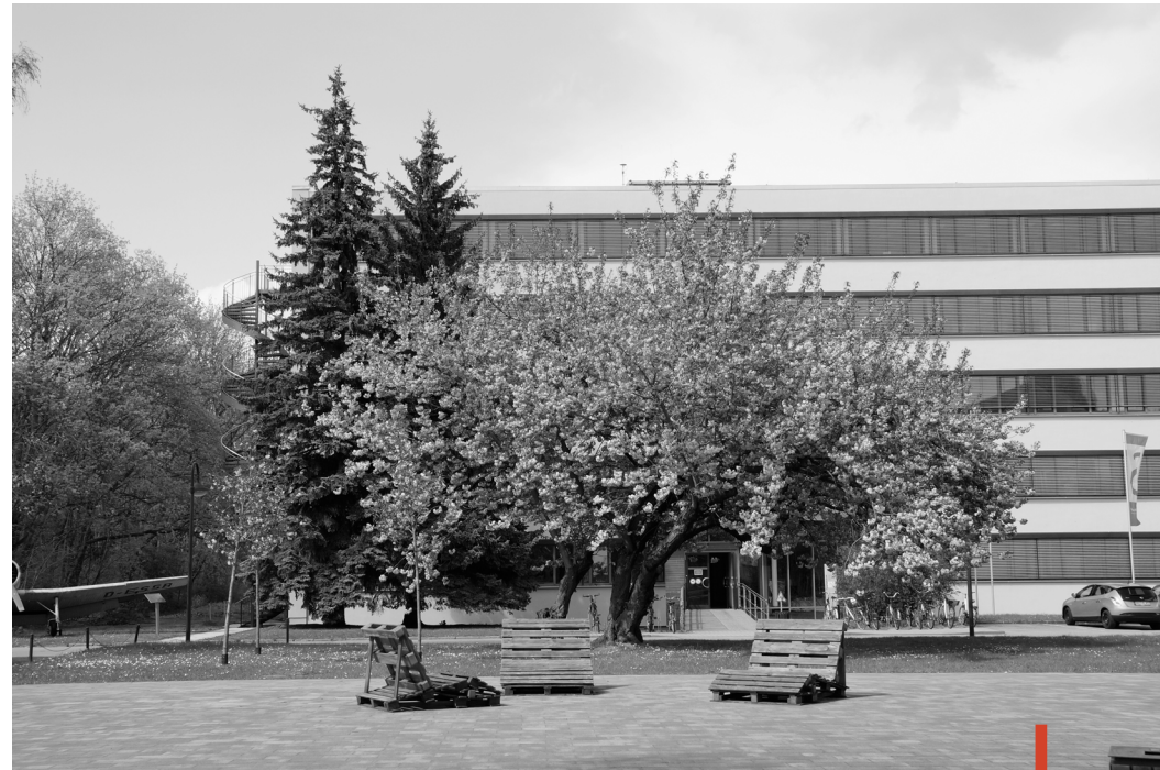
1 Anhalt University of Applied Sciences Campus