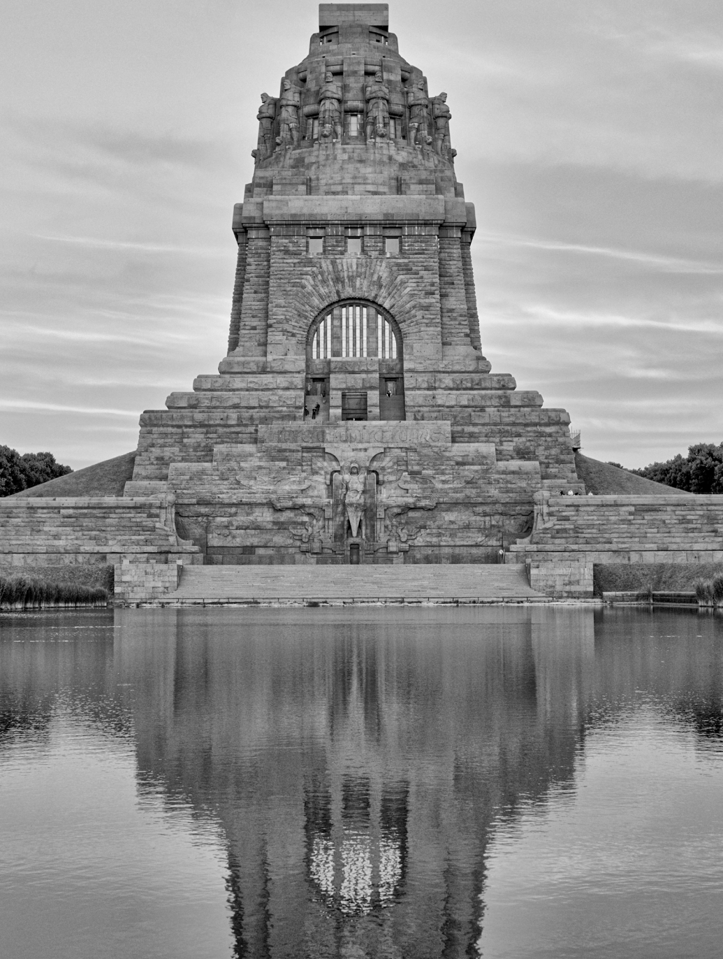
1 Monument to the Battle of the Nations