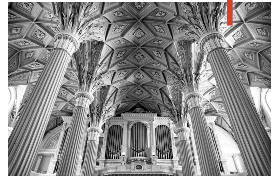
1 Opera House Leipzig 2 Nikolai Church Leipzig