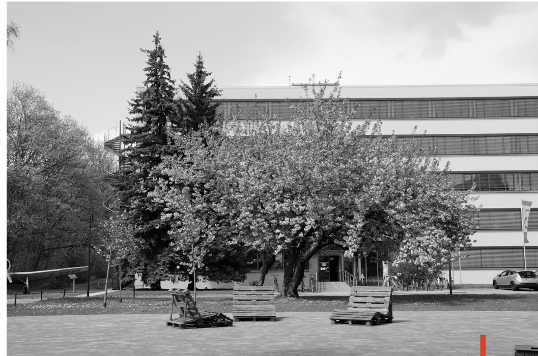
1 Anhalt University of Applied Sciences Campus